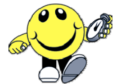
Timing by Miles of Smiles

Trophies for the first three finishers in each age group in each division in the 5K race. There is no division for walkers; however, walkers who finish among the top three in any age group will be awarded the trophy. Race results will be posted at smileymiles.com