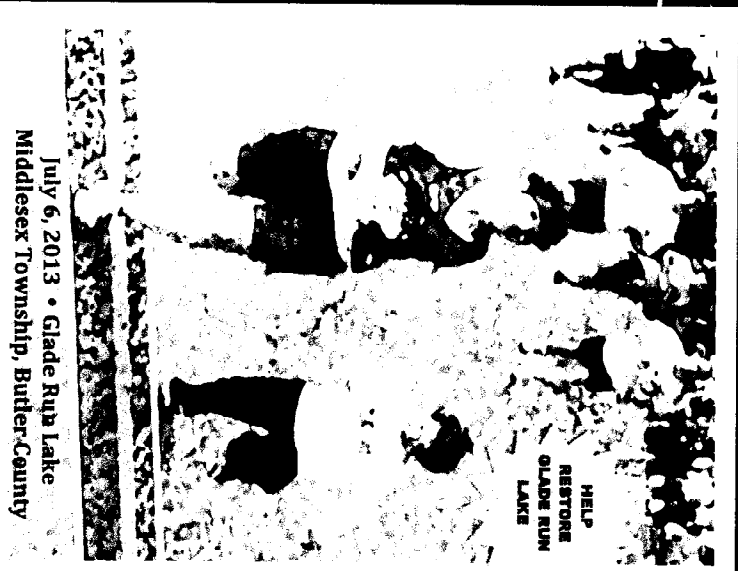
July 6, 2013 • Glade Run Lake Middlesex Township, Butler County

GRLC is a 501(c)(3) nonprofit organization.